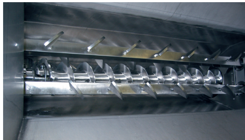
View inside the hopper with adjustable paddles above the conveying screw