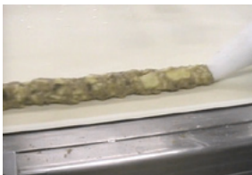
Strudel filling before and after being pumped onto the pastry base